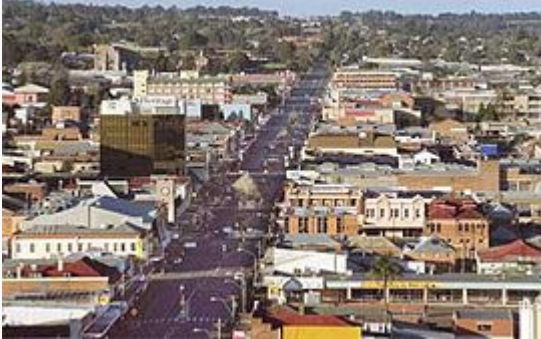
Toowoomba CBD and inner suburbs looking south