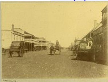
Main Street of Toowoomba in 1897.

Main article: History of Toowoomba, Queensland